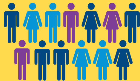
People with the same type of cancer

Your doctors will test the cancer to see if the cells contain a particular molecular target that is helping the cancer grow. Different people with the same cancer type may receive different treatments based on their test results.