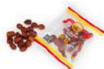
Dried red dates