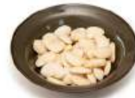
White bean/lima/butter bean