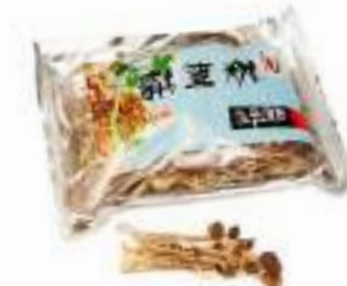
Tea tree mushrooms