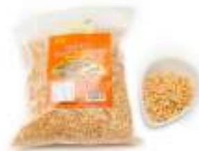
Chopped roasted peanuts