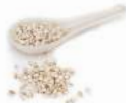
Coix seeds/ Job's tears