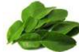
Kaffir lime leaves fresh (above) dried (right)