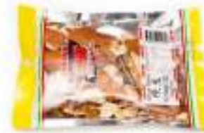
Dried tangerine/citrus peel