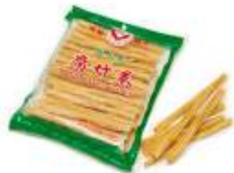
Bean curd sticks