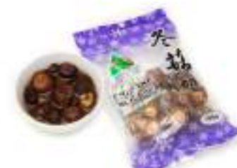
Black mushrooms/ Shitake mushrooms