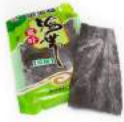
Dried sea kelp