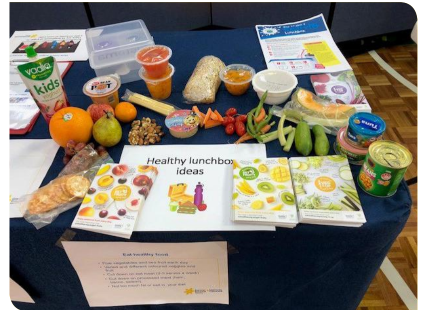
Healthy lunchbox ideas displayed by the Cancer Prevention Education team at exhibitions across Tasmania.