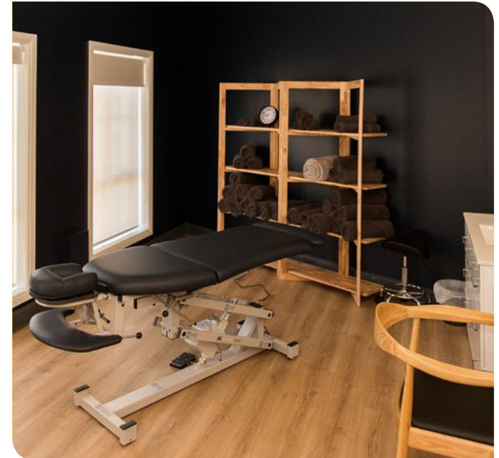
The Southern Cancer Support Centre opened in May 2018 thanks to the funds donated to the Cancer Council Tasmania. Pictured is the new massage room (table purchased with funds generously supplied by Aurora Energy).