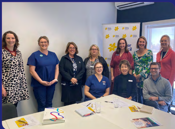
Service providers meeting

Our supportive care team has increasingly been getting out into our community, providing education about services we provide at Cancer Council Tasmania.