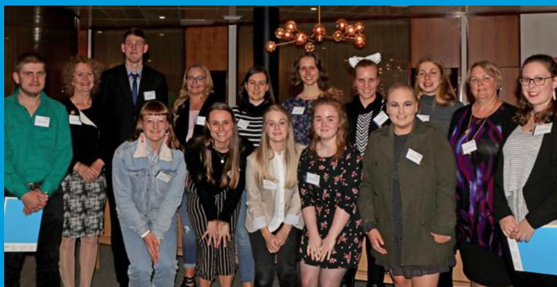
Award recipients from southern Tasmania