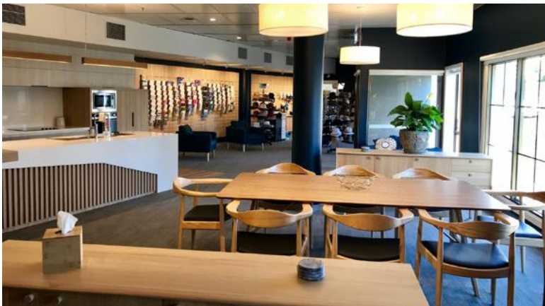
Our new Southern Support Centre in Sandy Bay