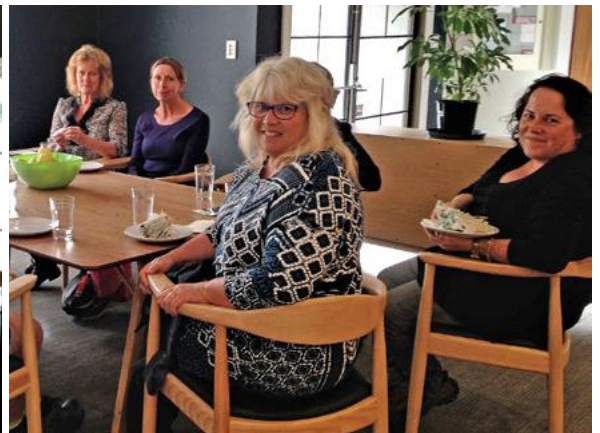
Central Highlands walking group enjoying their new surrounds

The Southern Cancer Support Centre opened on the 9th April 2018. It is the second Cancer Support Centre developed by Cancer Council Tasmania (CCT), with the Northern Centre operating for five years in Launceston. The environment at CCT's Cancer Support Centres and programs are based on the 'Maggies' model of psychosocial support services.