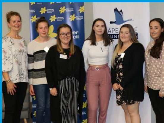
Award recipients from northern Tasmania

This year's Seize the Day Awards gave out $30,000 in scholarships to 28 Tasmanian students who have been impacted by cancer.