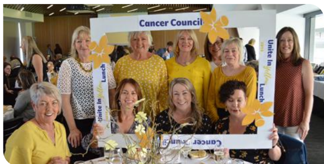
Hobart Unite in Yellow Lunch