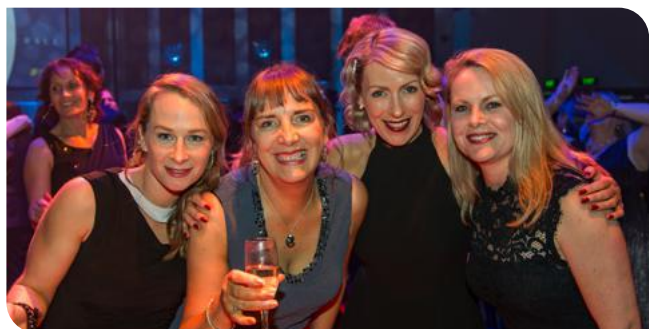
Hobart Winter Gala Ball