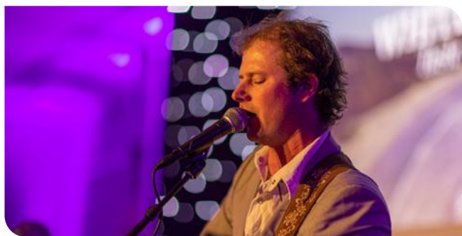
Sparkle for Hope Gala Ball

...to all our guests, supporters and volunteers who make our events such a success. 'Over $170,000 net revenue raised!'