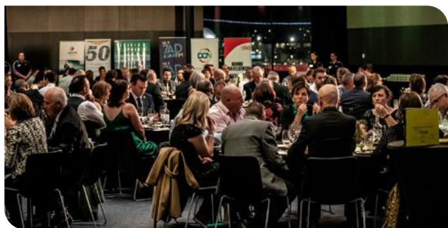
Unite In Yellow Gala Dinner